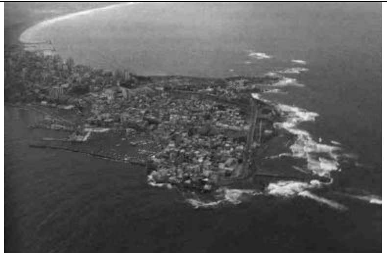
The City of Tyre is today a thriving city and seaport. God has issued a judgment against this city and says it will be consumed by fire ( Zech 9:4 ). This has not happened yet!

firepot in a woodpile, like a flaming torch among sheaves. They will consume right and left all the