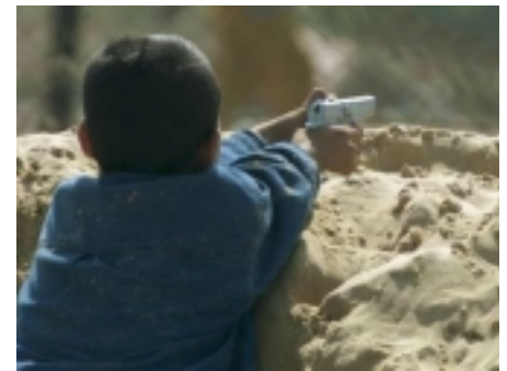
Another trainee martyr – and his father is so pleased.