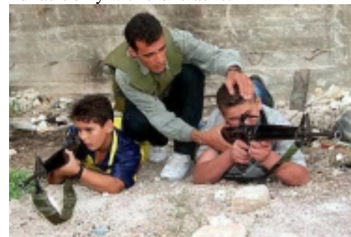
"You're worth $3,000 if you die as martyrs, my sons, so do your duty!"