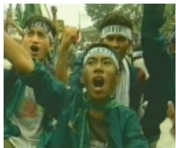
The fanatical faces of Indonesian Muslims as they terrorize all non-Muslims.

In the City of Solo, close to Jakarta, Muslim hordes terrorized the streets, demanding that all Americans leave within 24 hours. The U.S. has ordered the U.S. embassy in Jakarta to close, and evacuate. They've also advised all Americans to stay out of the country. They've warned that all Muslim countries are now considered high-risk areas.