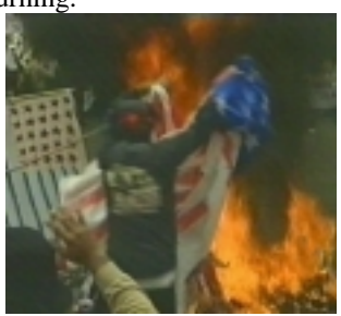
U.S. flags are in short supply in Indonesia. They've all been burnt.