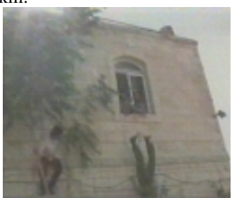
You're supposed to believe the Moslems are the virtuous underdogs. The mutilated body of an Israeli soldier is thrown out of the window of the Ramallah police station.

The Palestinians gunned down a rabbi who tried to intervene in the desecration of Joseph's tomb. They have deliberately murdered many Israelis, and what is more, they've deliberately murdered their own people in order to blame the Israelis. The problem is, the media circus seems to want to sanitize everything the Moslems do and find fault only with the Israelis.