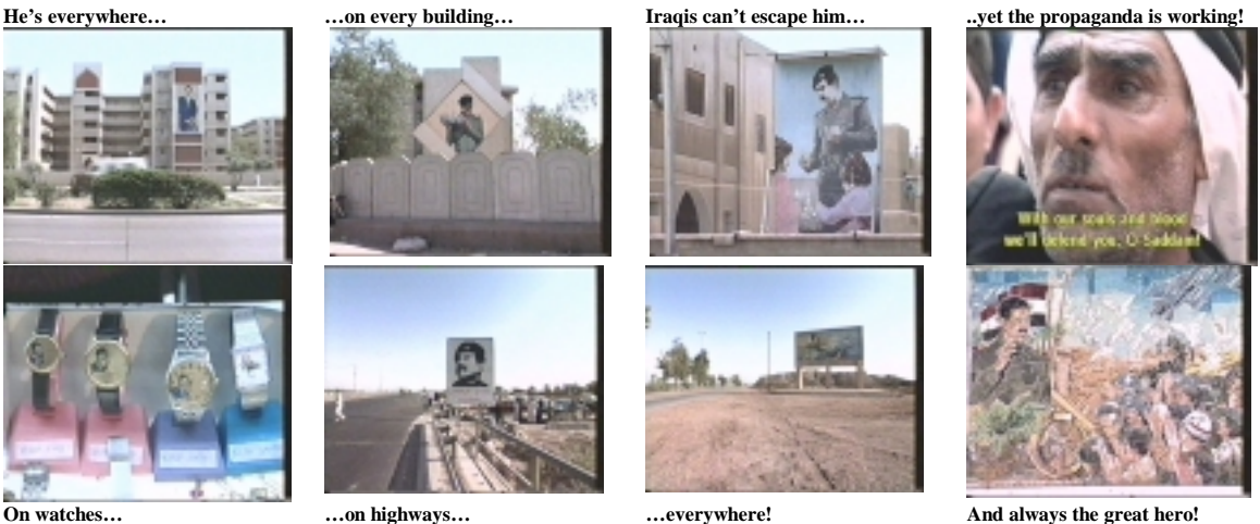
...on highways... ...everywhere! On watches...

He can't understand why the rest of Islam don't recognize him as the great saviour and prophet. He needs something to propel him to hero stature in the eyes of all his peers. Fighting the U.S. is not an option! He tried that and failed. But a more modest target is Israel. He seeks an opportunity to flex his muscles without involving the mightiest power on earth. He reasons that the Palestinian propaganda machine is winning sympathy, while terrorists are being activated to create havoc with bombs and terrorist acts, and putting U.S. personnel on edge.