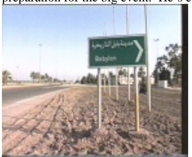
Did you know that the Bible speaks of a signpost to Babylon? (Eze 21:19). It has a lot more to say too, in the same chapter!

Saddam Hussein is not finished yet. In addition to offering his 4,000,000 strong army for the destruction of Israel, he also has a capital city in mind for all Islam. He's been busily building it in preparation for the big event. He's even put up a signpost to show the way.