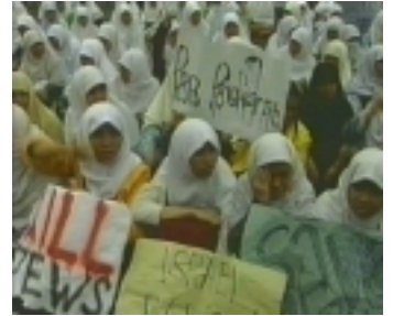
The sign on the left says 'Kill Jews'. The one beside it is a call for Israel's destruction.

It's already begun! On October 30, 2000, Indonesian Muslims took to the streets. Their fanatical madness resulted in burning and destruction. The objects of their hatred were made plain with signs such as 'Kill Jews' and the usual U.S. flag burning.