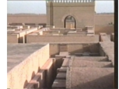
This immense city of Babylon will soon be completed for the task it will fulfill in prophecy.