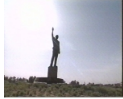
100 foot statue of Saddam giving the two-finger salute to all those who don't like him. All Iraqis love him – or else!!