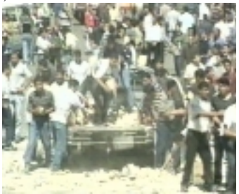
Media scrum footage. They cart in stones to throw and bottles to make Molotov cocktails. The guns are hidden out of sight.