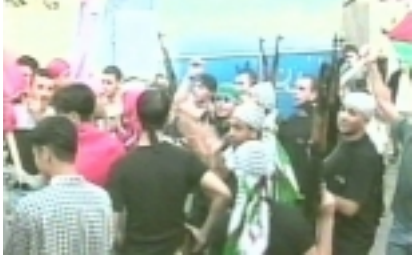
Let's pretend the Palestinians don't have guns! These are terrorist snipers who shoot to kill!

What the media circus has reported throughout this entire conflict in Israel is the perverted view that Palestinians only threw rocks and firebombs. They reported that the Israelis were shooting live rounds of ammunition. Yet almost every piece of footage they showed featured Palestinians with automatic weapons. The amount of live ammunition fired by the Palestinians far exceeded that fired by the Israelis. Unlike the Israelis who fire rubber bullets, the Palestinian terrorists shoot to kill.