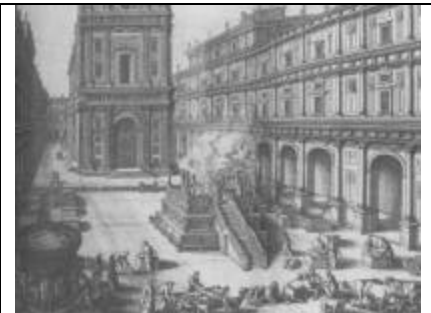
An artist’s impression of the Temple. Note the ziggurat appearance of the altar, which stands before the Temple housing the Sacred Rock – the former place of God’s Throne. This is what pagans have simulated down through the ages. Note the Great Sea resting on 12 bulls in the lower left of picture.