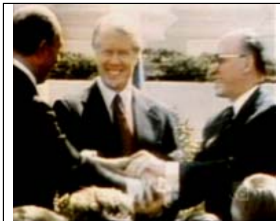
It was a courageous move by Anwar Sadat of Egypt to make peace with the Israelis, and he got himself killed for doing it. Jimmy Carter has been exploiting it ever since, and always in defense of Islam. He sees himself as ‘the great white hope’ for all of God’s enemies. He’s particularly buoyant and affable when others are criticizing his country. And this from an ex-President of the U.S.! Menachem Begin on right, Jimmy Carter at center, Anwar Sadat at left.

It’s the stricken part of the sentence that people have such a hard time believing. How could such a mighty power as the U.S. be stricken ? Surely America has the financial and technological muscle to overcome any adversity – haven’t they? Well, you only have to go back three years to the September 11, 2001 date to realize how destabilized the world has become. The torpor of those previous years has been replaced with growing anxiety for anyone of Arab descent entering an aircraft. Everyone is painfully aware of the dangers of visiting Moslem countries, even if it’s in the perceived