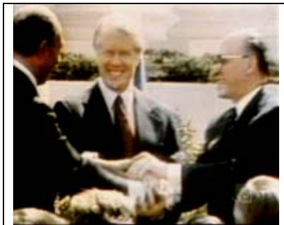
It was a courageous move by Anwar Sadat of Egypt to make peace with the Israelis, and he got himself killed for doing it. Jimmy Carter has been exploiting it ever since, and always in defense of Islam. He sees himself as 'the great white hope' for all of God's enemies. He's particularly buoyant and affable when others are criticizing his country. And this from an ex-President of the U.S.! Menachem Begin on right, Jimmy Carter at center, Anwar Sadat at left.

It's the stricken part of the sentence that people have such a hard time believing. How could such a mighty power as the U.S. be stricken ? Surely America has the financial and technological muscle to overcome any adversity – haven't they? Well, you only have to go back three years to the September 11, 2001 date to realize how destabilized the world has become. The torpor of those previous years has been replaced with growing anxiety for anyone of Arab descent entering an aircraft. Everyone is painfully aware of the dangers of visiting Moslem countries, even if it's in the perceived