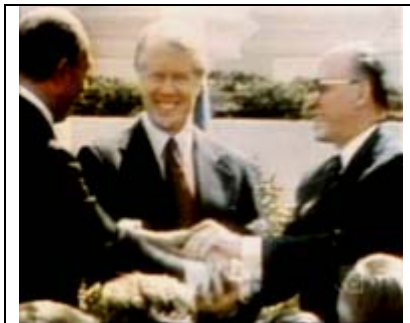
It was a courageous move by Anwar Sadat of Egypt to make peace with the Israelis, and he got himself killed for doing it. Jimmy Carter has been exploiting it ever since, and always in defense of Islam. He sees himself as 'the great white hope' for all of God's enemies. He's particularly buoyant and affable when others are criticizing his country. And this from an ex-President of the U.S.! Menachem Begin on right, Jimmy Carter at center, Anwar Sadat at left.

It's the stricken part of the sentence that people have such a hard time believing. How could such a mighty power as the U.S. be stricken ? Surely America has the financial and technological muscle to overcome any adversity – haven't they? Well, you only have to go back three years to the September 11, 2001 date to realize how destabilized the world has become. The torpor of those previous years has been replaced with growing anxiety for anyone of Arab descent entering an aircraft. Everyone is painfully aware of the dangers of visiting Moslem countries, even if it's in the perceived