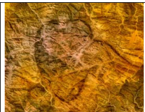
Interesting landsat imagery of Mount Horeb. What do you see? I'll leave it to you. Perhaps you see a bowed head with an eagles wing over it.

So is that all there is? Do we now wait until the time comes for Jesus to return and restore everything? Is this what God intended? Are there to be no more prophets until this occurs? – as some have foolishly concluded! Was the Apostle John a prophet even after the Christ departed? He surely was! It was he who penned the final book of prophecy: the Book of Revelation, the conclusion to all that is written. Even in this Book there is reference to two end-time prophets who have supernatural powers and the ability to destroy their enemies. This is somewhat of a departure from the instructions