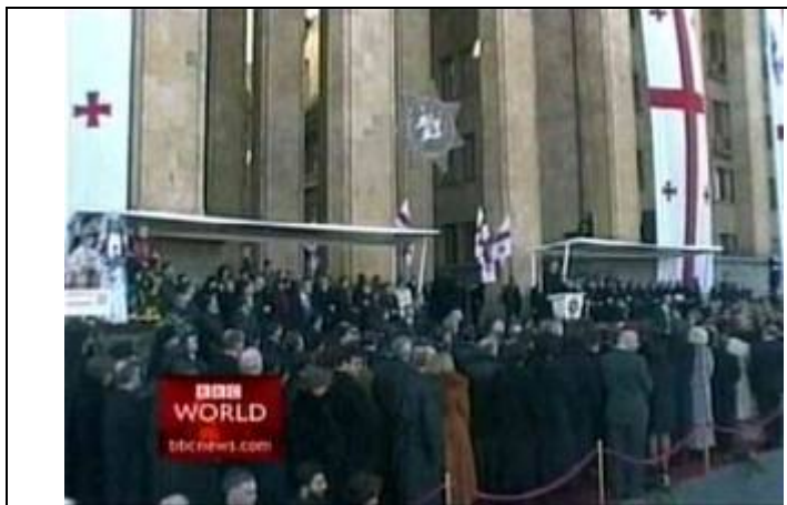
The new Georgian parliament simultaneously unveils their new flag – seen hanging from the walls here, and being waved by the enthusiastic crowds. Their new flag is identical to the former Knights Templar, and reflects their Polish roots and their former associations during the Crusades.

But surely America is invincible – what nation could conquer them? What nation would dare take on the might of the U.S.? Perhaps no individual nation could, but collectively all the nations could, and even now they are wearing down America’s power, and forcing America to become