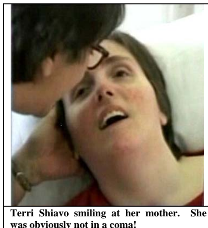
Terri Shiavo smiling at her mother. She was obviously not in a coma!

Because President Bush showed compassion in wanting to spare her, the Democrats went out of their minds in wanting her to die. As surely as the sun rises tomorrow, the guilty will be judged by the same yardstick, the very measure they used in killing the innocent. This particular case of Terri Shiavo got worldwide coverage. People were stunned at the brutal lack of humanity and decency by people who feigned outrage over the Abu Ghraib prison affair, yet chose to starve to death a conscious and helpless woman. These same hypocrites howl and rage over the rights of Moslem murderers in Guantonomo, but happily starve to death one of their own. Surely the fruits show them for what they are!